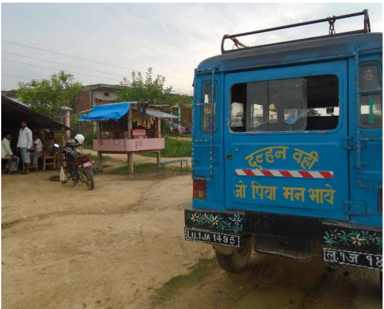
The bumper sticker on this Nepali van reads: 'Good wife is someone whom the husband likes'.

Similarly, in Bangladesh, some women believe that beating a woman is justified if she goes out without her husband's permission (in-depth interview with survivor), does not take care of the children (in-depth interview with