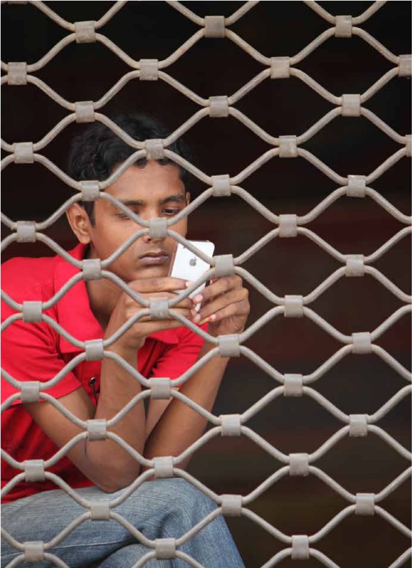
A man uses his phone in Dhaka, Bangladesh.