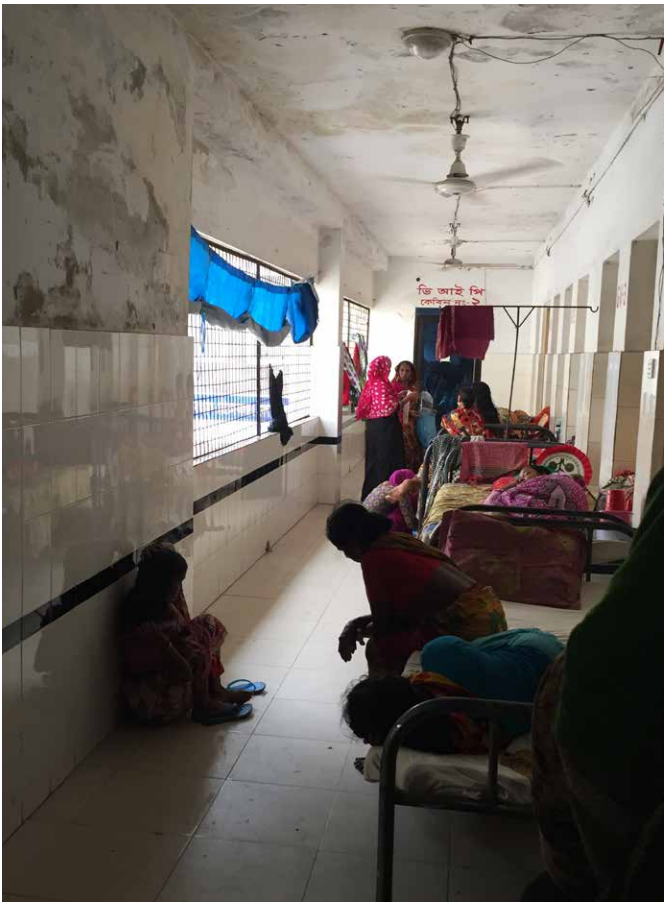
Women's ward of the hospital in Gazipur, Bangladesh © Fiona Samuels/ODI 2016