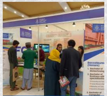
Dawn Education Expo