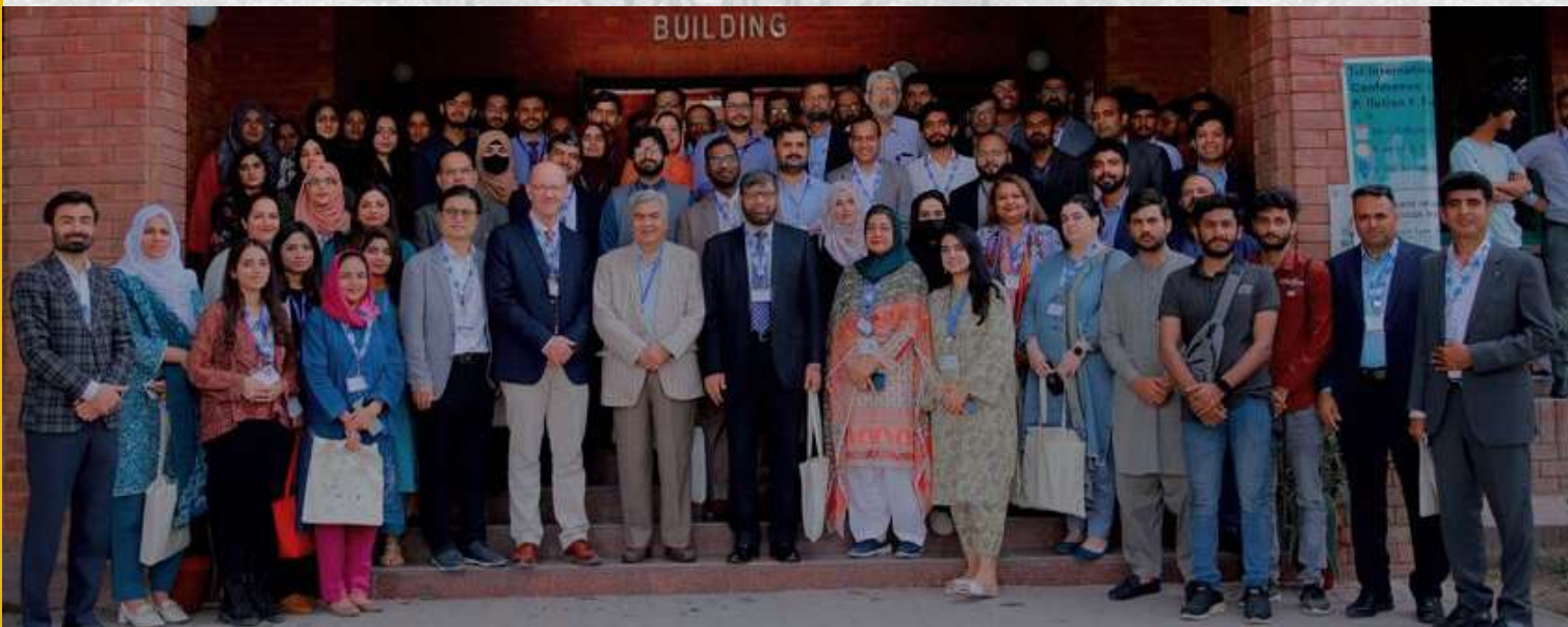
Group photo after the International Conference on Soil Pollution and Remediation