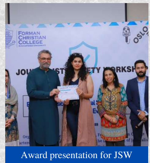
Award presentation for JSW