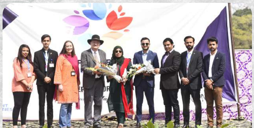
Young Entrepreneurial Gala