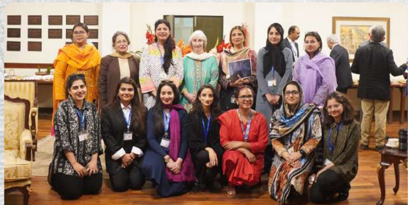
Event organized by CLT