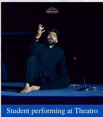
Student performing at Theatro