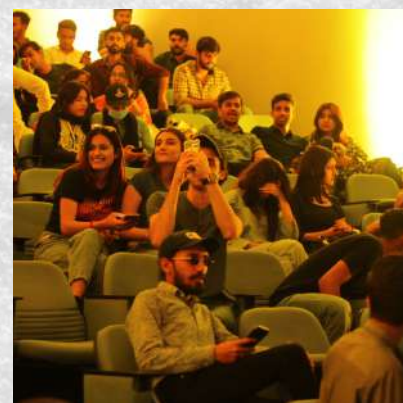
Students at Femme Tech