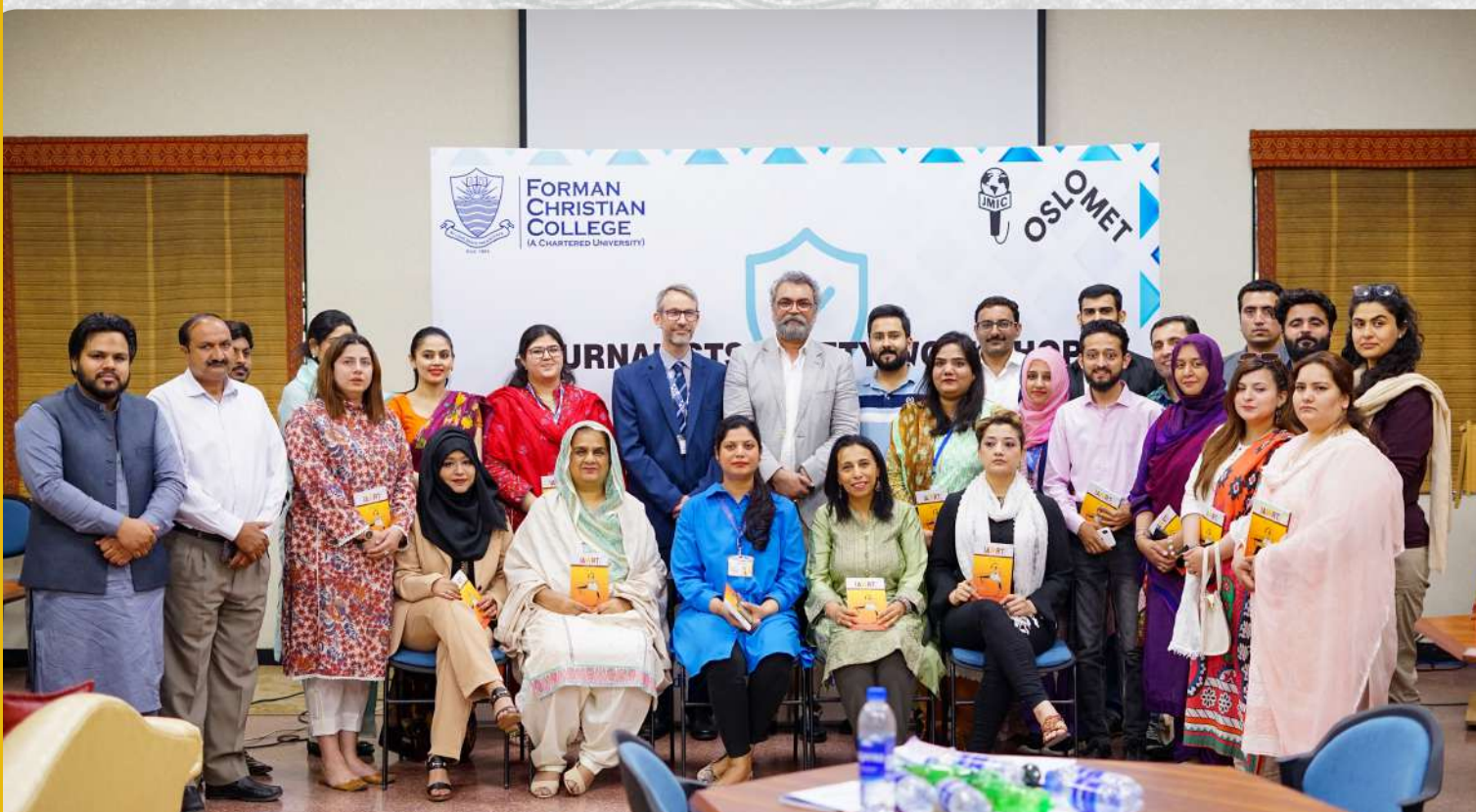
Group photo after the Journalism Safety Workshop