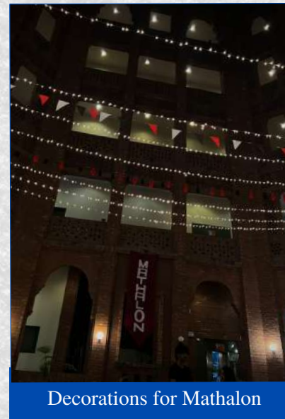
Decorations for Mathalon