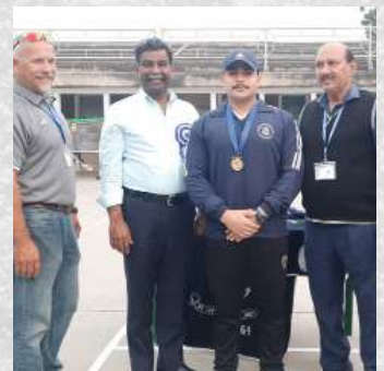
FCCU Sports Gala