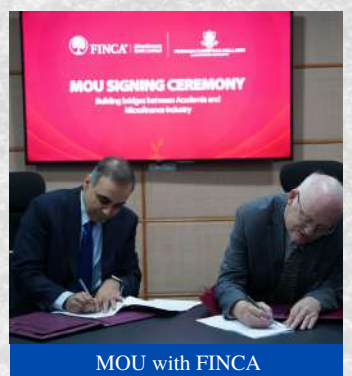
MOU with FINCA