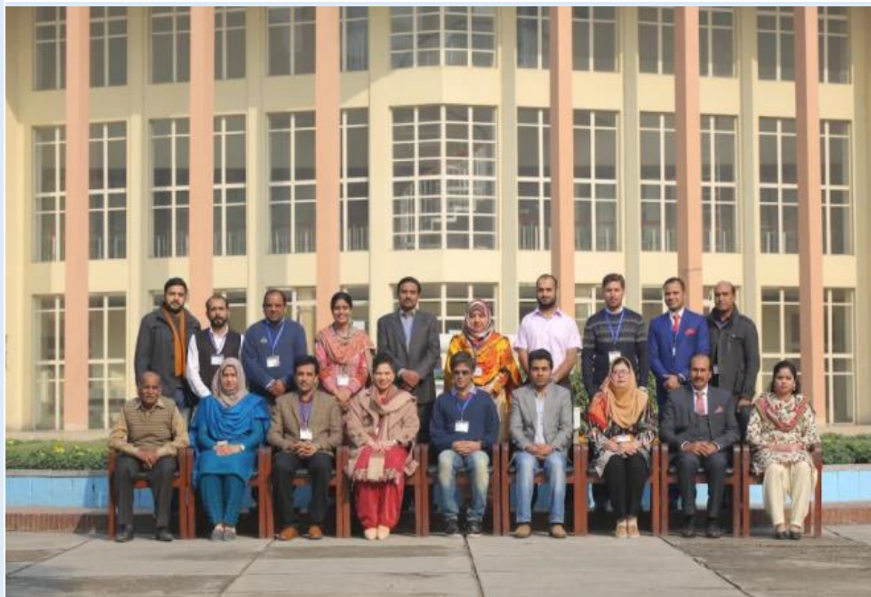
FACULTY &amp; STAFF PHOTOGRAPH WITH VICE RECTOR (COLLEGE)