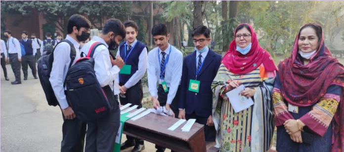
ICC team welcomed freshmen