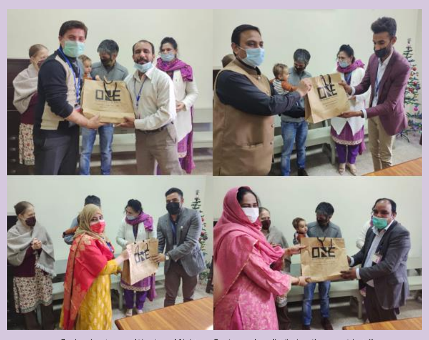
To share happiness and blessings of Christmas, Faculty members distributing gifts among lab staff