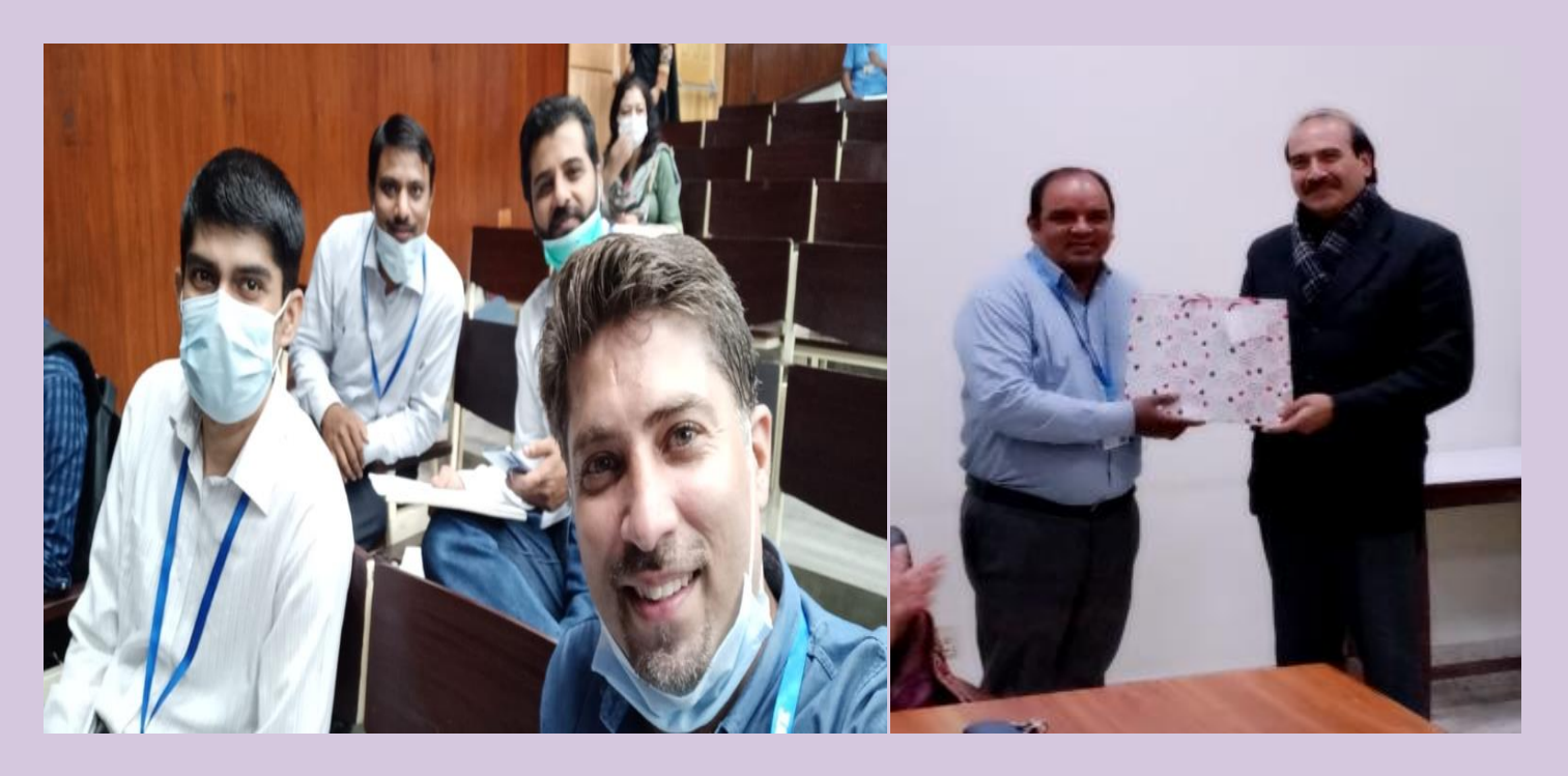
Faculty Retreat, 2021