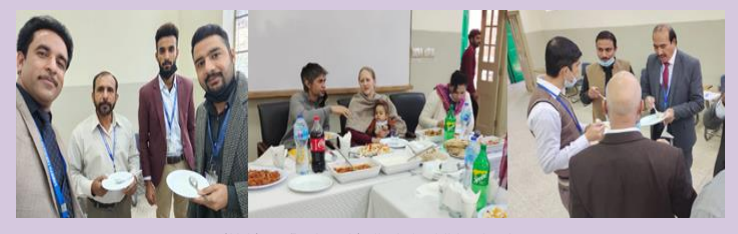
Chief Guest, Faculty and Staff enjoying delicious Lunch.