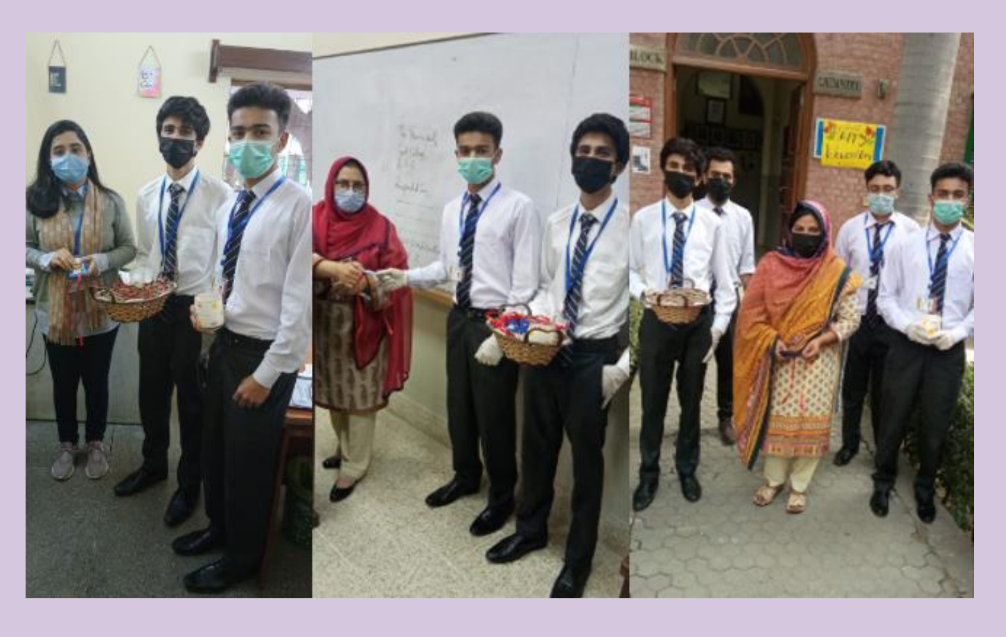
Students presenting cards and souvenirs to female faculty members