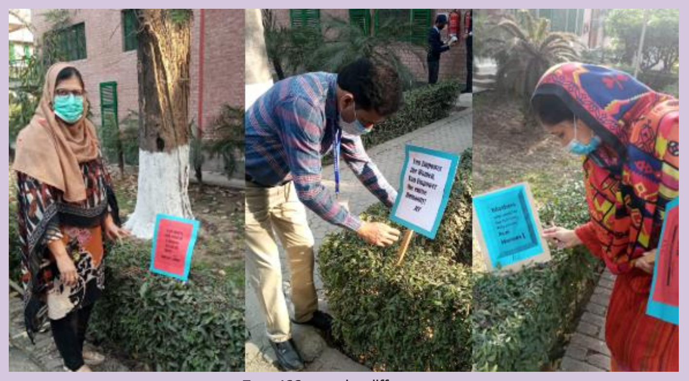
Team ICC mounting different posters