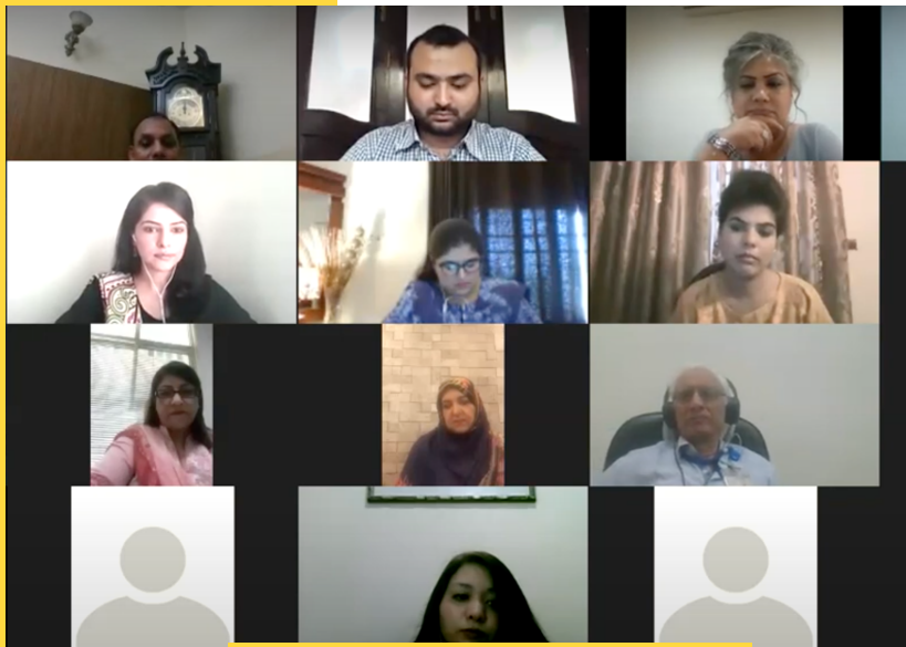
MOU SIGNING WITH CSS

Subsequently, the department of education signed three memorandums of understanding with The City School Network, The Cornerstone School and Idara-e-Taleem-o-Aagahi for virtual internships. The ceremony was organized by the department of Education, FCCU virtually. One of the purposes of these partnerships is to prepare our student-teachers for the new-normal. Three separate ceremonies were held where dignitaries from both sides attended the occasion. We are thankful to all three organizations and we hope to strengthen our partnership in the future.