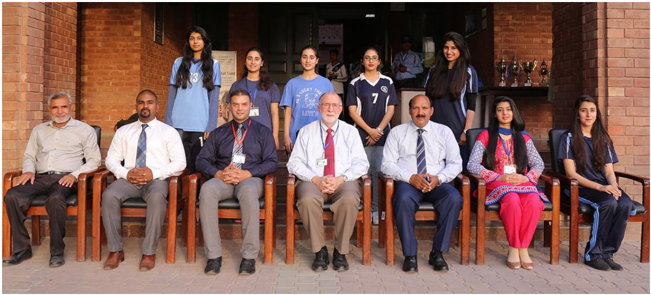
University Cricket Team: