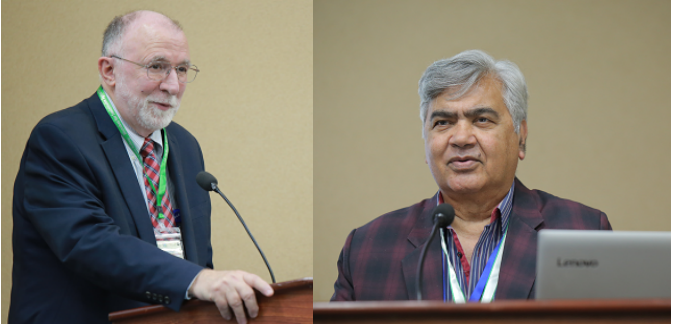
Furthermore, during the sessions high definition live streaming was organized for long distance viewers. In order to access the recorded session please CLICK HERE.

In addition to provision of technical services to the conference, Information Technology Services Department at FCCU provided portable digital signage screen. The digital signage screen included various images to highlight the moments of the conference. The slideshow also included digital display of the poster presentations of the participants and students of the conference from various universities. On this occasion ITS also provided LED with additional display of the presentation for the chair and co-chair.