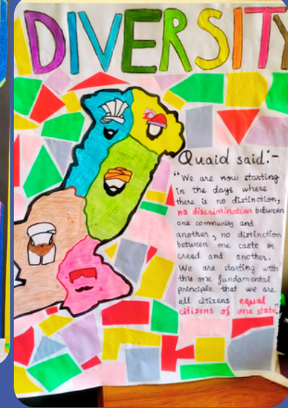
1 M1 3rd Position