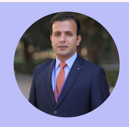
MR.MOHSIN'S RESEARCH ARTICLES

https://www.proquest.com/DOCVIEW/ 2637407252 https://archives.palarch.nl/index.php/ja e/article/view/10869