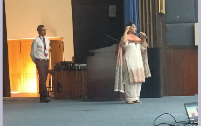
The honorable College Vice Rector and Ma'am Coordinator addressing students at Students' Orientation 2023