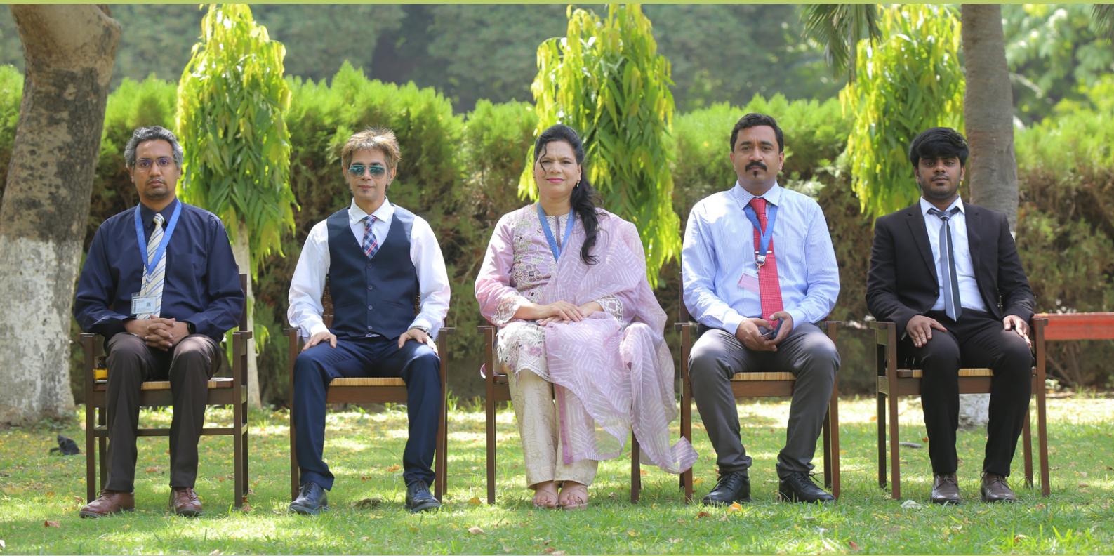
Annual Photograph with the College Vice Rector and the College Coordinator