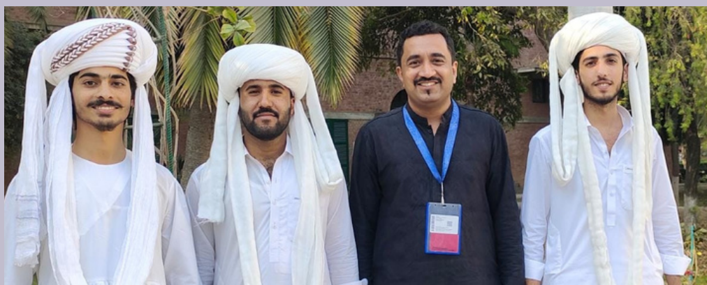
ALC Spring Fiesta where students from both first year and second year classes participated in cultural attire