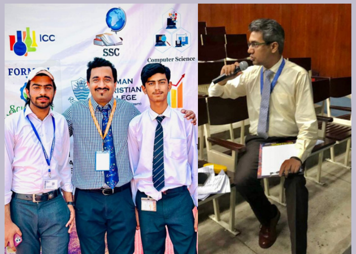
Some clicks from Scio Con 1.0 and Character Building Poster Competition