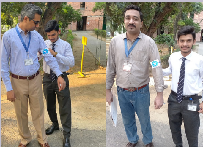
Student Clubs were involved by CPO in welcoming first year students