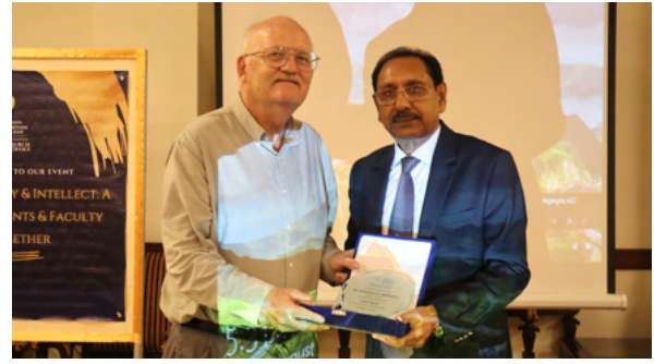
Rector FCCU, receiving shield from Director FCRO