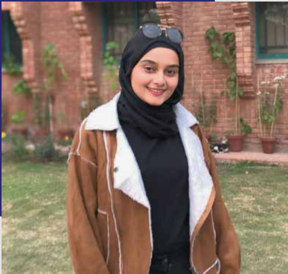
EEMAAN NAVEED GRAPHICS