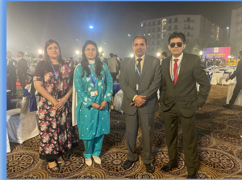
Faculty at First Year Welcome Dinner