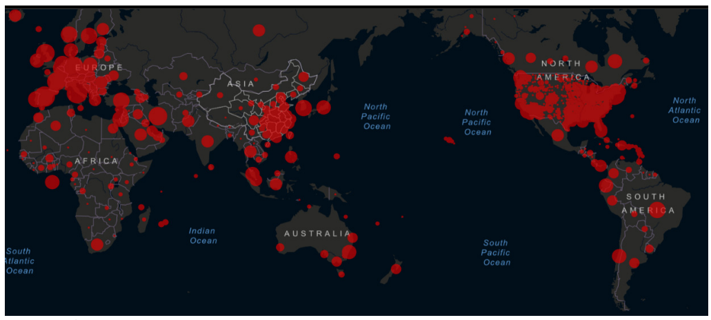
Map A: Shows the global outbreak of COVID-19 as on 29 March 2020.

Source: The Center for Systems Science and Engineering at Johns Hopkins University.